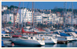
St Peter Port